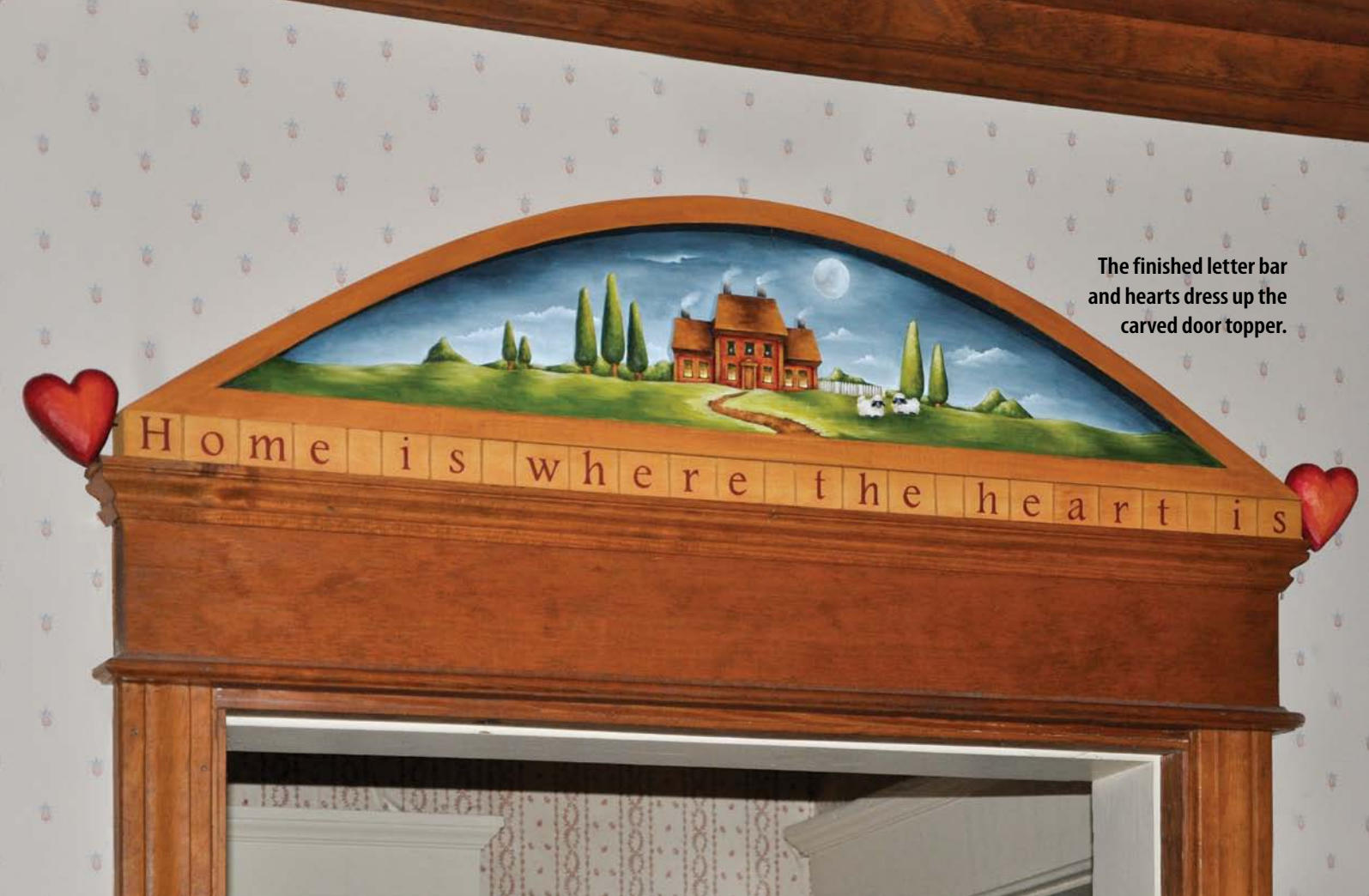
The finished letter bar and hearts dress up the carved door topper.